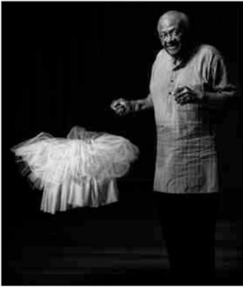
HOLY HERO Archbishop Emeritus Desmond Tutu