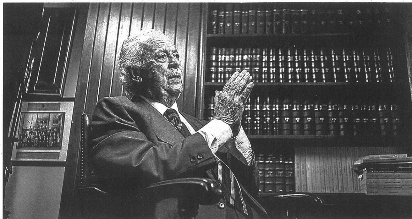
'IF NEEDS BE': George Bizos during the photo shoot for the 21 Icons project