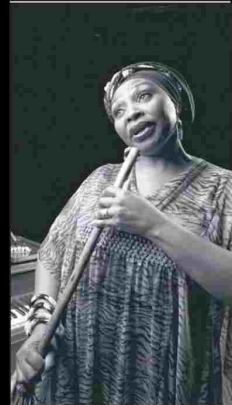
Yvonne Chaka Chaka