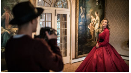
🛗 Date: Sep 11, 2015

Season 3 of 21 Icons focuses on South African youth