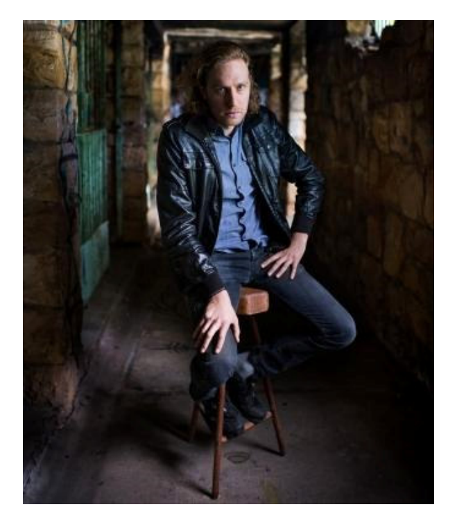
(http://www.mytvnews.co.za/wpcontent/uploads/2015/11/Mikhael-Subotzky.jpg) Mikhael Subotzky

On 6 December 2015 on SABC 3 at 19h27, the acclaimed short-film series 21 ICONS will feature the 14th icon of its third season: 34-year-old contemporary visual artist and photographic social activist, Mikhael Subotzky.