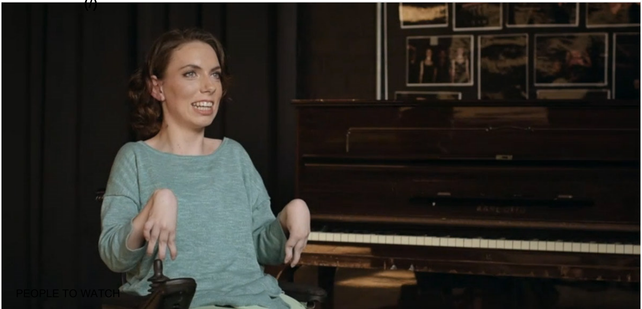
PEOPLE TO WATCH