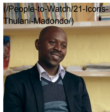
(/People-to-Watch/21-Icons-Thulani-Madondo/) 21 SEP 2015