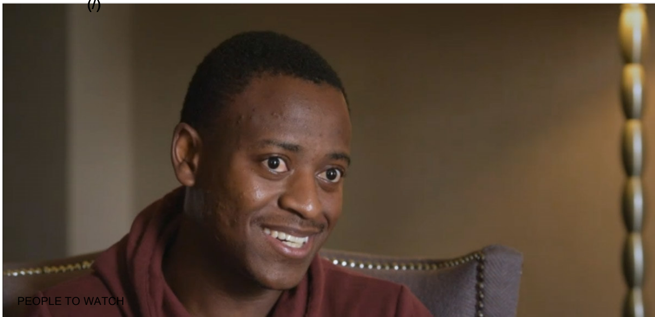
PEOPLE TO WATCH