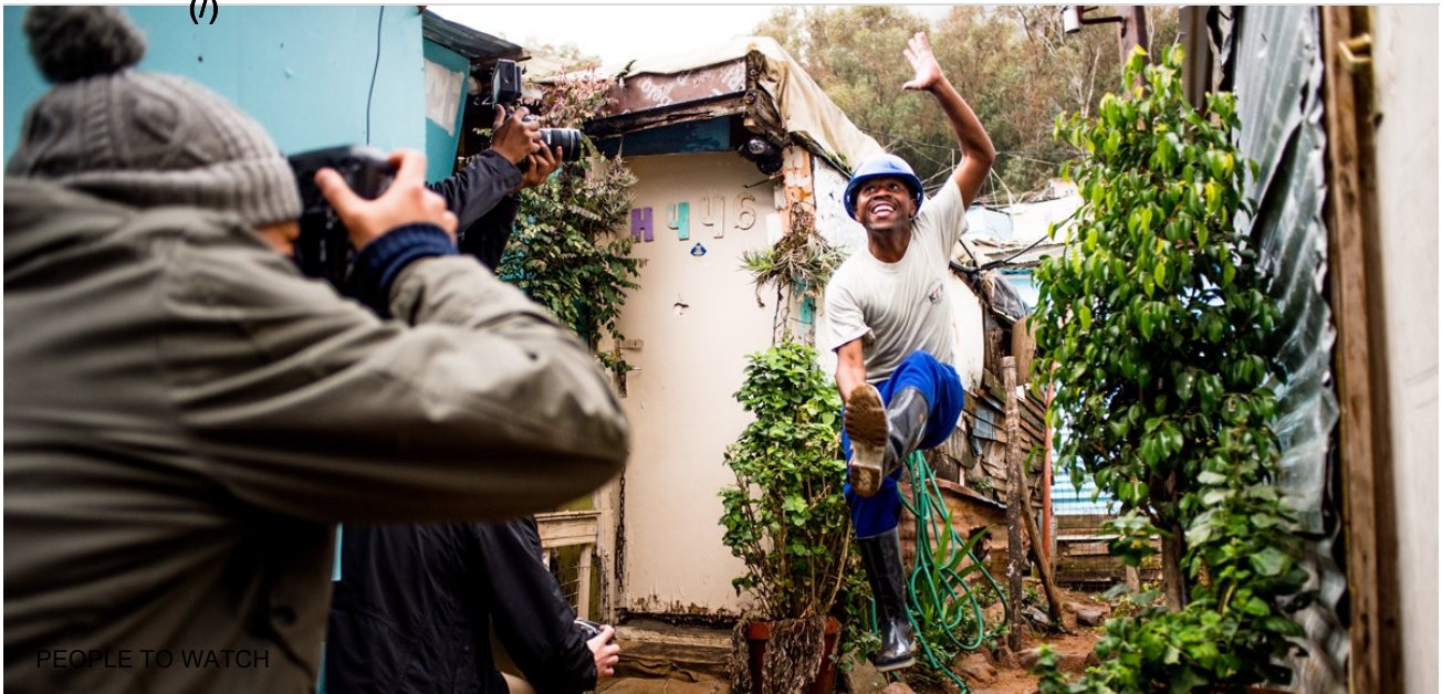
PEOPLE TO WATCH