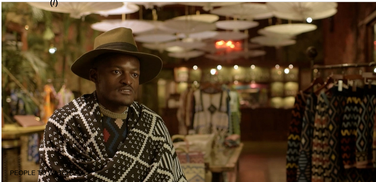
PEOPLE TO WATCH