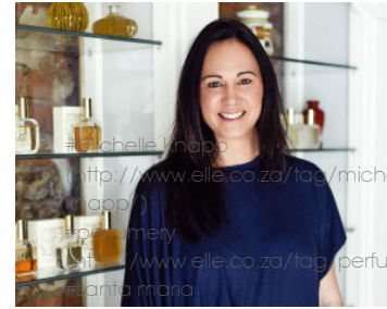
( http://www.elle.co.za/meet-michelle-knapp-of-santa-maria-novella/ )

ELLE MEETS OJOMA IDEGWU ( http://www.elle.co.za/elle-meets-ajoma-idegwu/ )