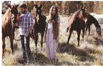
( http://www.elle.co.za/old-khaki-ss16/ )

OLD KHAKI SS16: WANDERLUST ( http://www.elle.co.za/old-khaki-ss16/ )