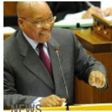
NEWS Parliament should have held Zuma accountable