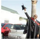
PROFILES Why a security guard never gave up on his legal studies