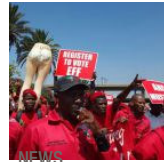
NEWS Guptas to take the EFF to court following "unexpected" threats