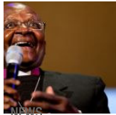
NEWS The Tutus make peace with granddaughter