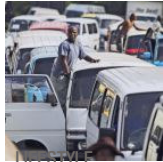
LIFESTYLE Life lessons we can learn from Jozi taxi drivers