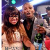
NEWS SA reality stars arrested for possession of drugs